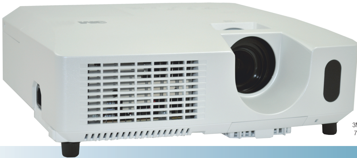
3M X46 Projector 78-9236-7725-2